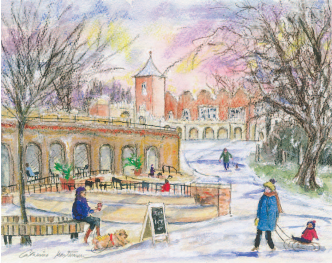
HO19 Holland Park Café 2018