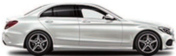
Miles & Miles

Rassells plant nursery has been on this site for over 100 years and is a local institution. The plants for sale change with the season, and you can find unusual gems among the more recognisable trees, shrubs and annuals. The staff show real interest and are great on advice, from what to plant to how to plant it and what treatment it needs to survive. They also sell cut flowers and house plants. Check them out at 78-80 Earls Court Road. Tel. 020 7937 0481. Offer: 10% off all purchases in the nursery and flower shop.