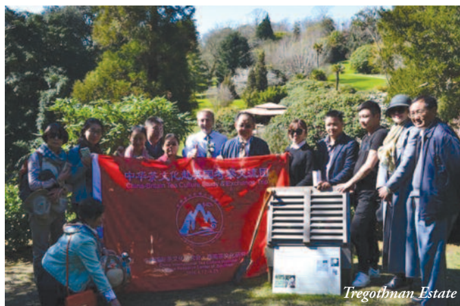
Tregothnan is truly international

Holland Park has venerable camellias but has not had the