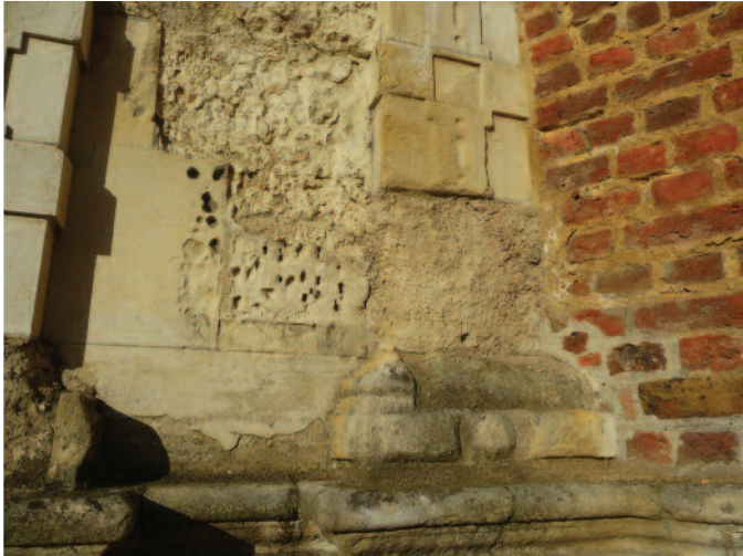
Damage to Holland House

In the autumn newsletter, we were pleased to report that the conservation plan for Grade 1-listed Holland House was being drawn up in three stages, with work on the roof and facings of the main building due to start this autumn. Well, it seems the Council has hit a snag, and there is as yet no news about when this essential work will start: this year or next. We understand that the detailed plans of the stage-one work have not yet been sent to Historic England, so The Friends are lobbying hard to get this important programme back on track. Parts of the stone facing are flaking off, the finials were loose and have been temporarily removed, and anyone who cares to look will see that the window frames in the east wing, housing the youth hostel, are in a very sorry state indeed. What another winter will