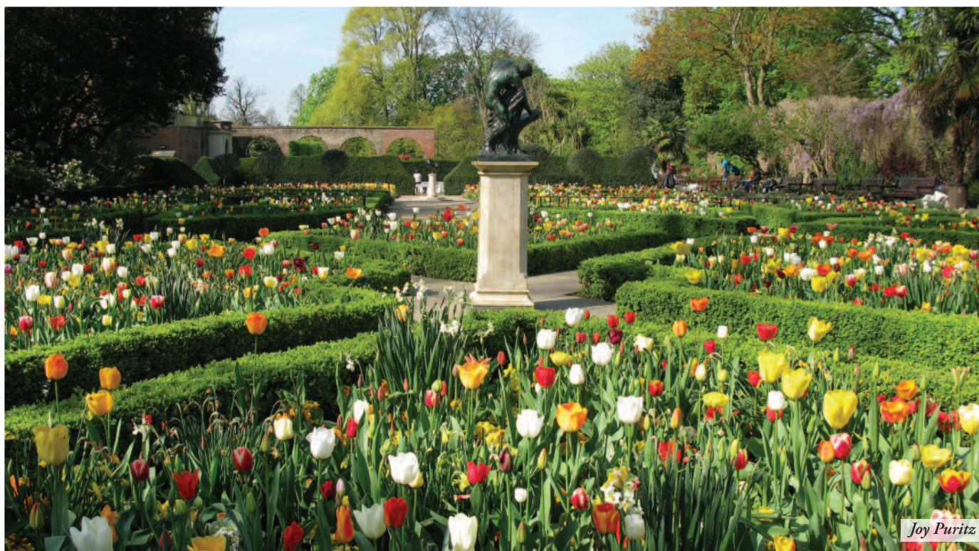
The Dutch Garden as depicted on the jigsaw puzzle

Readers are reminded that these jigsaws make excellent Christmas presents for single fanatics or family parties. They are of high quality and difficult enough to engage the most experienced with quirky shapes. Order from the website or on our order form.