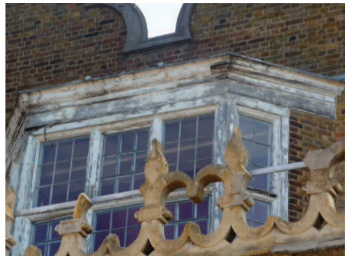
Windows, East Wing