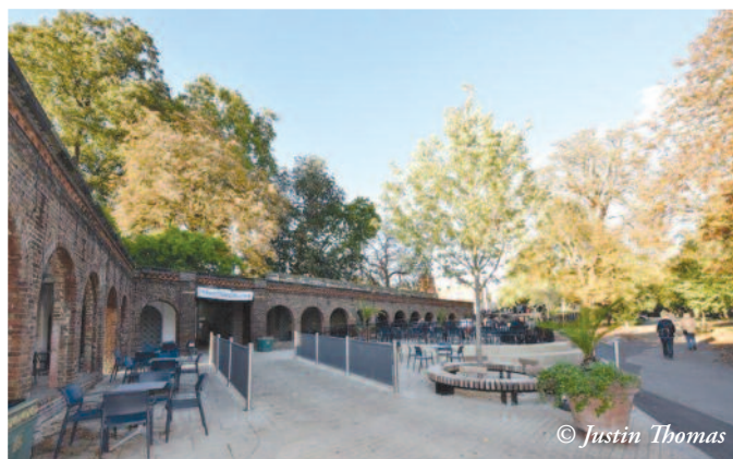
Holland Park Café

Established in 1953, Miles & Miles is London's oldest independent car rental company offering the widest selection of vehicles to hire in the capital – standard car, executive car, cabriolet/convertible or 4x4/SUV. All cars are fitted with Satellite Navigation. The reservations office is based in South Kensington, where staff advise on the most suitable car for your needs. Cars are delivered to the door by Miles & Miles or may be collected from London Heathrow, London City and London Gatwick Airport. 18 Petersham Mews, London, SW7 5NR. Tel. 0207 591 0555 www.milesandmiles.co.uk Offer: 15% discount (off the tariff price) with every rental and any marque of car.