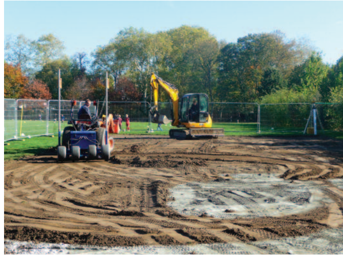
Total Play at work on the cricket nets

Contractor, Total Play, were able to start earlier than expected on improved cricket nets, and were on site by 15 October, with work expected to take around four weeks. id verde say they are pleased that the cricket 'cages' will be surrounded by a 3m security fence, and hope this reduces misuse and damage which, sadly, has been a problem with the current nets.