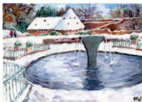
HO16 Iris Fountain and Ice House