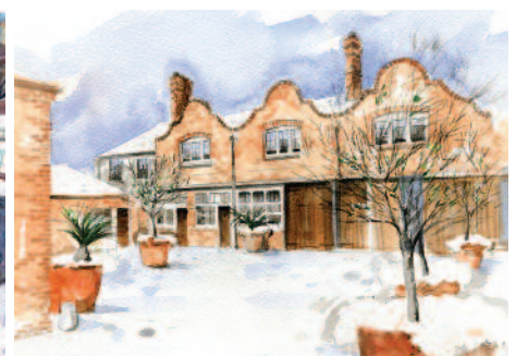
HO18 Stable Yard in Snow