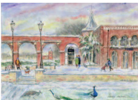
HO12 Belvedere and Arches